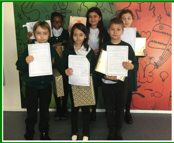
Science competition winners with their work and prizes