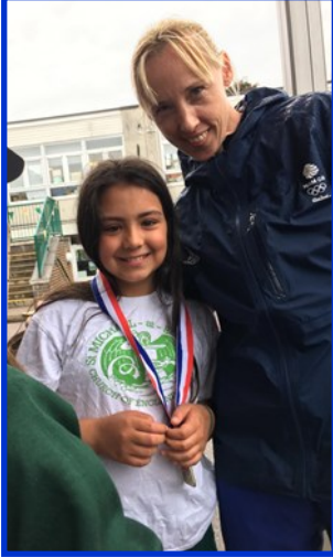
and experience with SMAB and hope we can collaborate with her again soon!